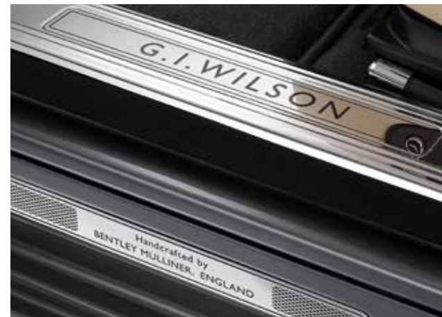
Personalised tread plates