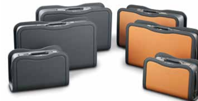
Mulsanne fitted luggage set