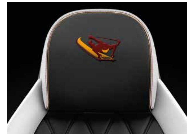
Personalised seat embroidery