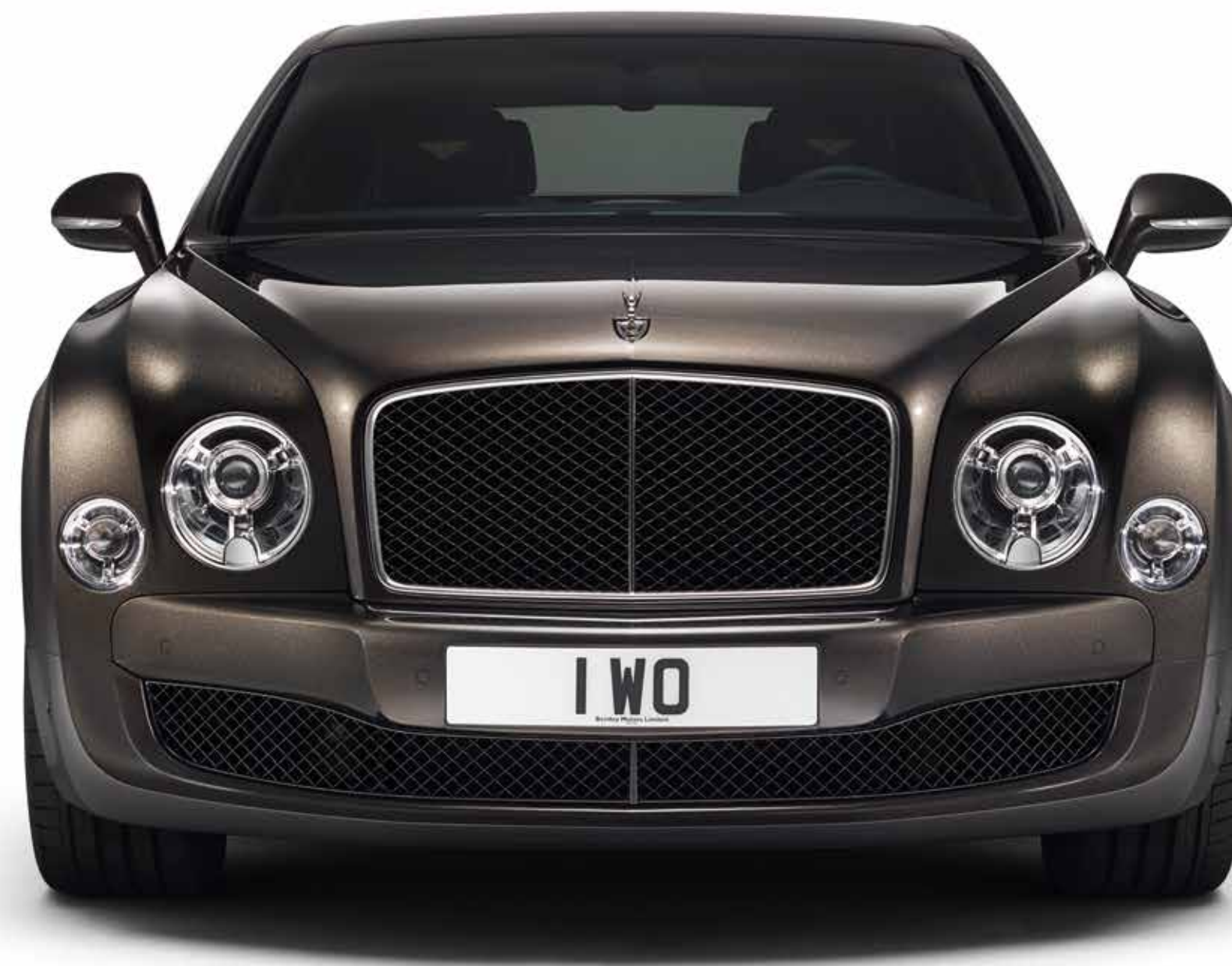
A dark tint to the brightware gives the new Mulsanne Speed a presence that commands attention.

Both the Mulsanne and the Mulsanne Speed feature the re-calibrated V8 engine, with 13% efficiency improvement, and it delivers 50 miles (80 km) greater range.