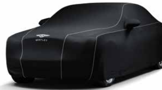
Personalised car cover

View the Collection at Shop.BentleyMotors.com or contact your local Bentley dealer.