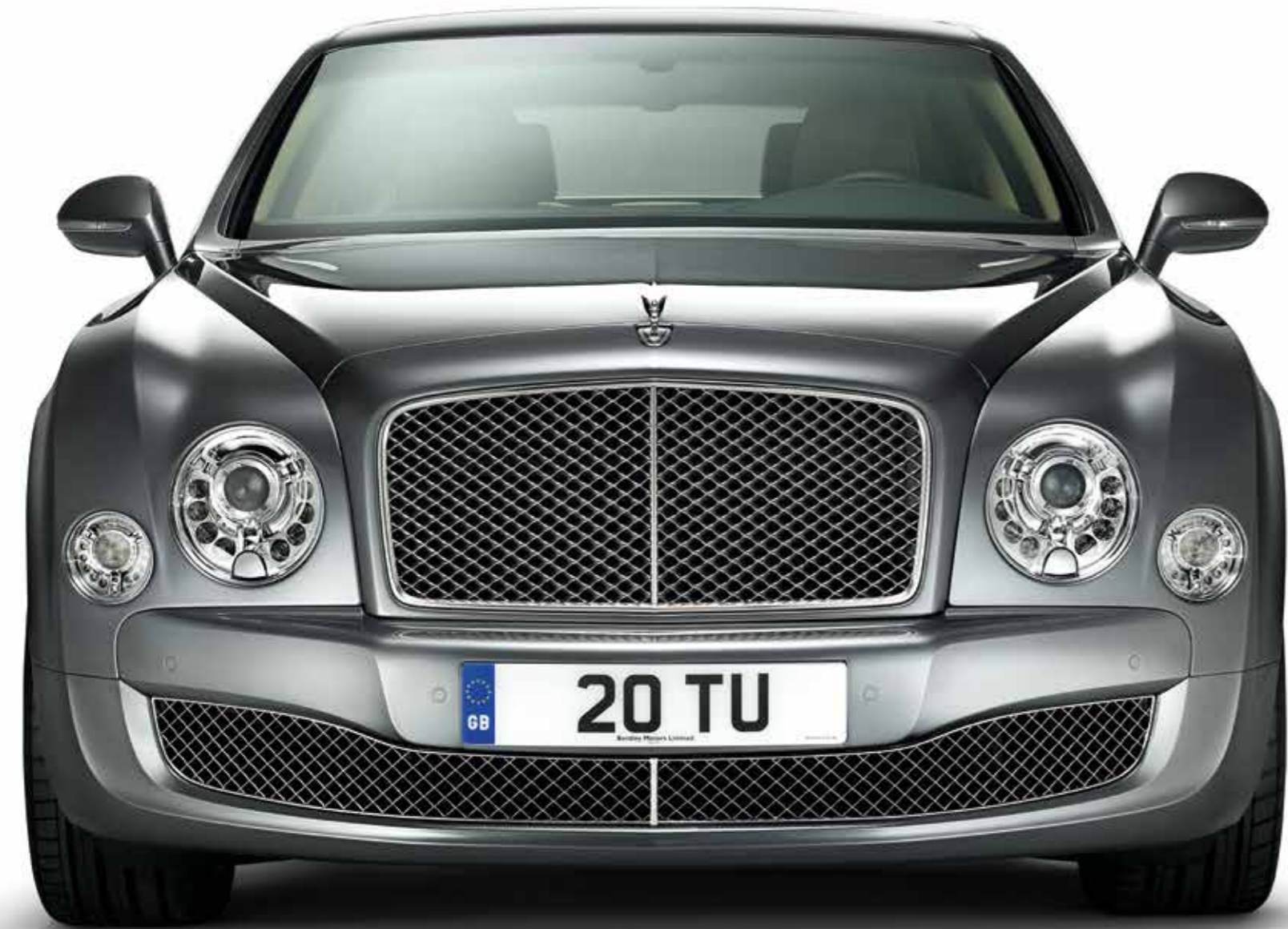
Stainless steel brightware provides the Mulsanne with the elegant looks of a true luxury automotive classic.